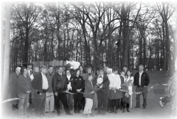
A ribbon cutting for Light Up the Lake was held on opening day.