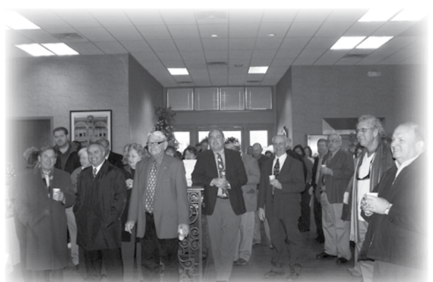
Commercial Bank , Mineral Wells hosted a large crowd for the December Chamber Coffee.