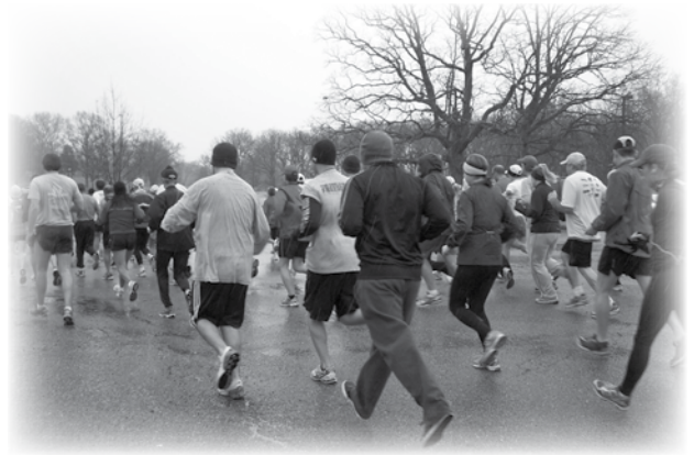
The runners start the 8 mile walk/run at Paris Landing State Park.