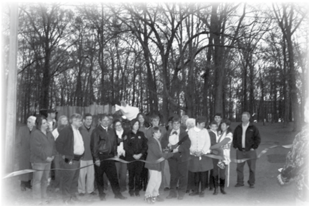
A ribbon cutting for Light Up the Lake was held on opening day.