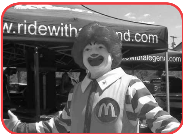
Ronald McDonald visited the Big Bass Splash, whose philanthropy is Ronald McDonald Houses.